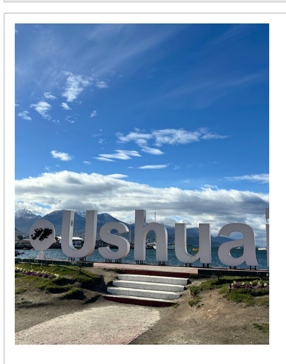
3 days from US$515 per person

Straddling the border between Argentina and Brazil, the Iguazu Falls are the largest of their kind in the world. Tumbling over the 3km-wide edge of the Parana Plateau, the falls consist of between 150-300 waterfalls, dominated by the long, narrow chasm that is known as the Devil's Throat. One of the world's true natural wonders, the sheer force and power of these falls can be felt on our extension which allows us to visit from both sides of the border. On the Argentinian side, we are able to wonder in, out and between the falls, whereas on the Brazilian side it is possible experience and observe the falls from a step back, which enables a true sense of perspective. What a wonderful way to cap your experience in Patagonia!